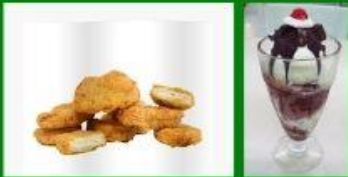
Dinner (chicken nugget & brownie sundae served

*Registration is required for the dinner. To signup, contact the Ingham County 4-H Office, 517-676-7303 or weissgle@msu.edu